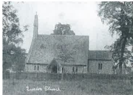
Quendon Church, 1909.

The Church of All Saints, Rickling, dates back to the 13 th century and probably stands on a pre-Conquest site. Later 14 th century additions include the first two stages of the west tower, the third stage dating back to the 16 th century. The Church of St Simon & St Jude, Quendon, is also a 13th century building. It was altered in the 16 th century and further restoration and building work was carried out in 1861. The tower was hit by a lightning strike in 1941 and was later pulled down. It was replaced by the current tower and three bells in 1963. Details of other listed buildings in the village can be found on the British Listed Buildings website 1 .