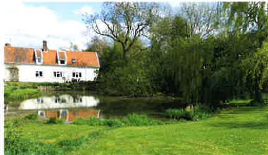
Dell Pond, Rickling Green, 2015.

An interest was also shown in future environmental projects; ideas such as the restoration and development of local ponds, a woodland trail and bulb planting were well supported. Better allotment facilities also attracted some interest and in Question 10, people were asked if they would be willing to help with these initiatives. The results show that there is both an interest in, and a will to engage with the local environment and this enthusiasm should be encouraged and used for the benefit of the village as a whole.