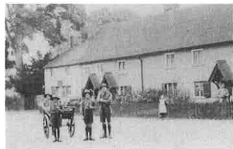
Boy Scouts and Scout Master in Rickling, 1915.

In the early 20 th century, a variety of clubs could be found in the village. A Mothers' Union, Women's Institute, Men's Society and Scouts held regular meetings, with a Horticulture Society and Flower Club catering for gardening enthusiasts. In the early 1900s a Coal Club and Shoe Club were set up, a weekly membership acting as a savings scheme for people. Sports clubs were also popular. In 1883, the village had an Archery and Tennis club, and the Tennis Club was