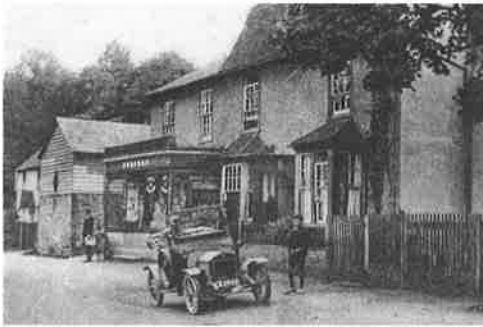
Mumford Stores, 1920s.