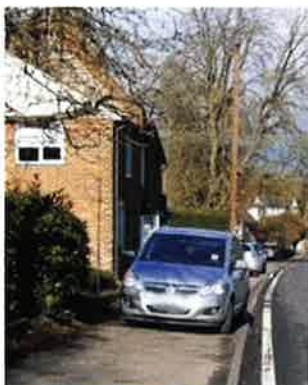
Pavement obstructed along Cambridge Road, Quendon.