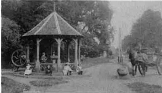
The Pump at the beginning of the 20th century.

Another familiar building is the Village Hall, which began life as a Reading and Coffee Room. A 'Grand Bazaar' was held in the grounds of Quendon Hall to raise funds for its construction. 10 Later that year a 'Fancy Bazaar' was held to raise funds for the building of the Parish Room. The curate of Rickling believed this 'would be a boon to inhabitants' and could also be used for religious and other purposes. 11