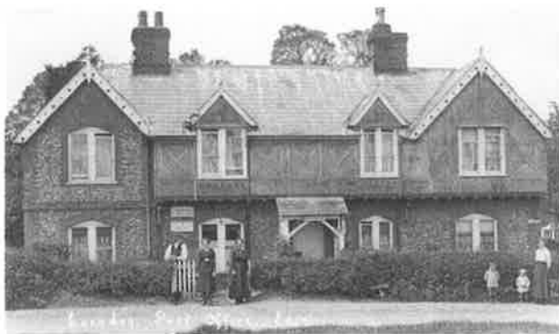
Old Post Office, c.1906.

Quendon windmill would have been a prominent local landmark. First mentioned in 1678, the original Post Windmill was blown down in 1795 and replaced by a Tower Windmill in 1805. This in turn was demolished c1900.