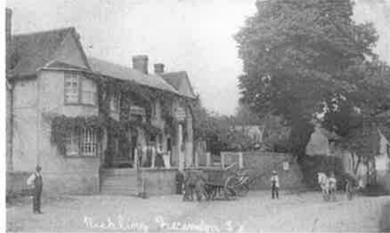
Coach and Horses, c. 1905