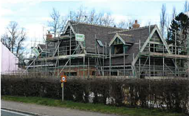
Two developments along the Cambridge Road, 2015

278 residents answered question 29, of which 56% felt that there is sufficient publicity given to planning applications in Quendon & Rickling. Further questions went on to determine the number and type of development that people would like to see in the village. Question 33 asked where new developments should be sited. Of the 170 respondents to this question, 99% would like them to be within the village boundaries. 95% also considered infill plots as suitable sites for development.