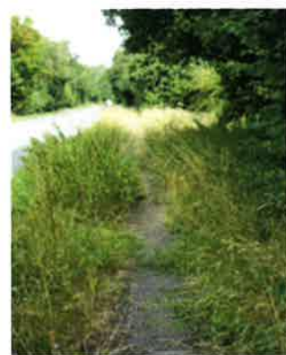
Pavement along B1383

Both this and The Environment section raised the issue of the condition and maintenance of pavements around the village. It is generally felt that they are in a fair state of repair within the core of the village, but this rapidly deteriorates as you travel towards Newport and Stansted. Encroachment of vegetation at ground level from poorly maintained hedgerows and verges restricts access for pedestrians, often making passage more or less impossible.