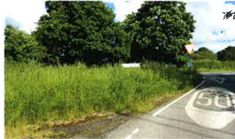
Junction of Belcham's Lane with the B1383.