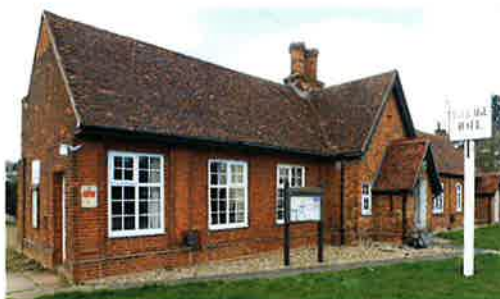
The Village Hall, 2015.