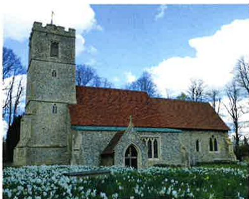
All Saints Church, Rickling, 2015

As long standing institutions within our community, the questions in this section sought residents' views on the Church and local schools. 73% of respondents value the part the Church plays in village life, a further 64% being aware of the role of the Friends of Rickling & Quendon Churches. Rickling School is also a valued part of our community with 97% of the respondents confirming this.