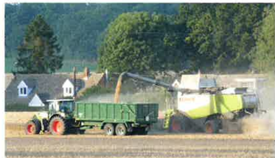
Harvesting in the 21 st century

In 2011, the population of Quendon and Rickling was recorded as 587, which shows a gradual increase of just 60 since the 1901 Census. However, the lives of the residents have changed in many ways. New skills in technology, trade and commerce are listed under 'Occupation', and very few of the residents now work in the village. Although surrounded by farmland, modern farming techniques and practices negate the need for a large local workforce. We have lost most of the trades and services enjoyed by past residents, but hopefully we have not lost their spirit and sense of community. Our village has evolved over centuries and will continue to do so. The Village Plan is our opportunity to contribute to its future.