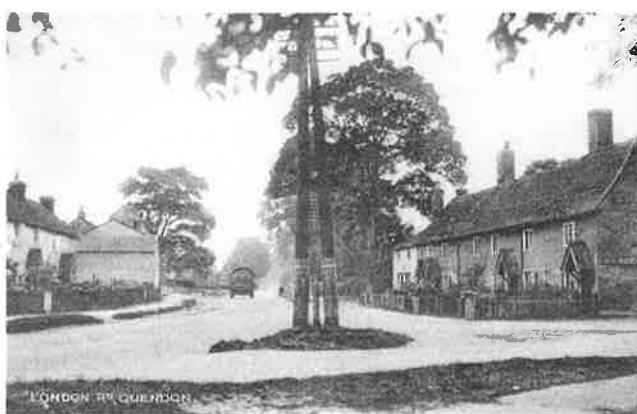
Junction of what is now, Rickling Green Road and Cambridge Road.

The 1870s saw the beginning of the decline in agriculture. The village population had increased to 708, with new trades and professions appearing on the census, but farming was still the main employment, with 129 men listed as agricultural labourers. By 1901, a population of 527 reflected the general move away from the land to the towns and cities. The agricultural workforce now totalled just 37, with 5 stock-keepers and a cowman listed. By the beginning of the 20th century, the village had witnessed some radical changes in society. Records show the population as 534 in 1931, rising slightly to 557 in 1951. Although still a rural community, the majority of the workforce no longer worked on the land.