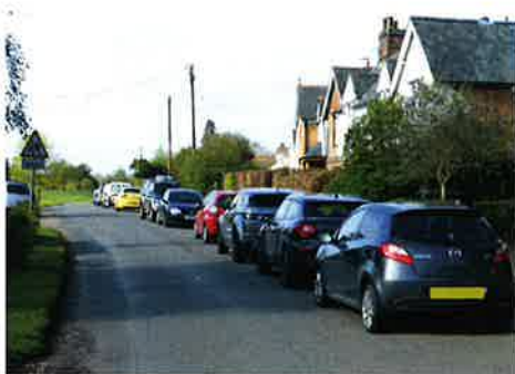
Parking along Rickling Green Road

This section also looked into the role the airport plays in the life of the village as both a transport hub and employer. Although the airport has a high profile in the area, it employs very few residents and plays a small role as a transport hub for commuters. Most journeys made from the airport are for leisure, a few people travelling several times each year, but less frequently for the majority of travellers.